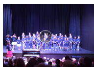
Summer Fayre in Photos