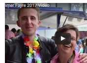
Summer Fayre Highlights Video 2017