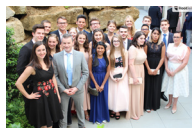
Secondary Celebrate the Next Chapter of their Lives